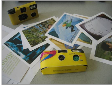
figure 3. Cultural probe package with disposable camera, diary and postcards.